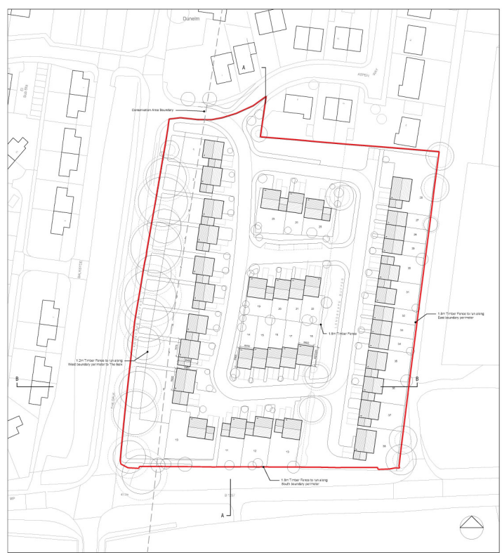
Proposed Site Plan 1:500 @A1

Red line planning boundary and ownership to be confirmed by clients agent