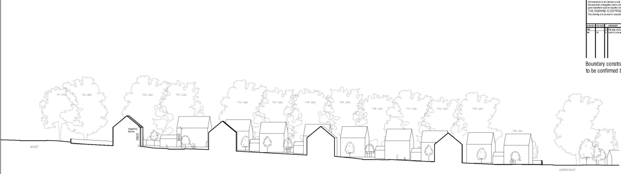
Section AA 1:500 @A3

Boundary constraints and ownership to be confirmed by clients agent